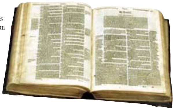
A 1607 copy of the Geneva Bible

After Tyndale had sealed the English New Testament with his life in 1536, the various Coverdale editions, building on Tyndale and culminating in the Great Bible, were an integral part of Anglican worship. This is why the words 'appointed' and 'authorised' began to be associated with these versions. The need was for one appointed Bible to be used for congregational as well as personal reading; and the Anglican Church was big on Bible reading! One agreed, approved Bible, to be read in copious portions day-by-day by week-by-week—a Bible to become fixed in memory from generation to generation, common from family to family and parish to parish throughout the kingdom. 5 Some of the reasons of constancy, continuity and wide familiarity, which supporters rightly urge