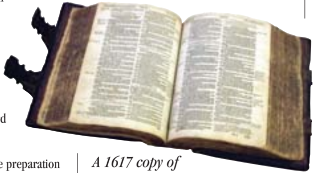
A 1617 copy of the Authorised Version

crowning jewel of one hundred years of translation work in Reformation England. Thanks be to God!