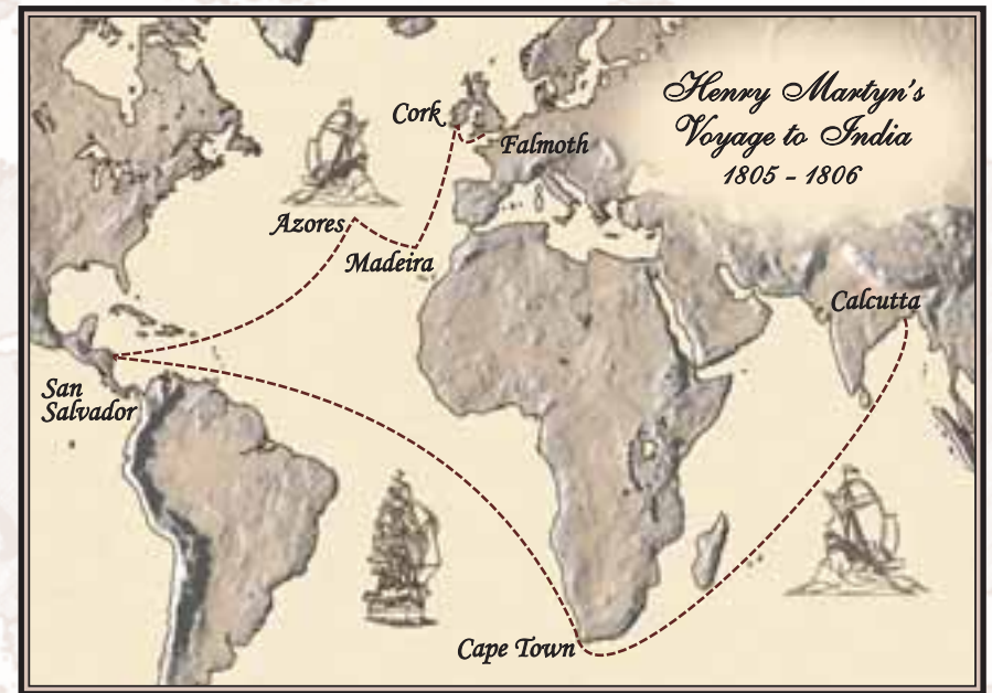
Map representing Henry Martyn's voyage to India

Being taken by his new friend to visit Carmelite and Franciscan monasteries, Henry took opportunity to discuss the doctrines of purgatory, papal supremacy and transubstantiation, in Latin and Portuguese, with the friars. Coming next to Cape Town he somehow became involved in the Battle of Blaauberg as a stretcher-bearer in the most horrid