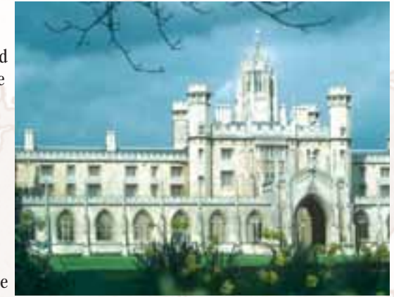
St. John's College, Cambridge