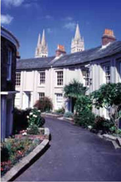
Truro, birthplace of Henry Martyn

Henry heard John Wesley preach. From his father, and famously from his younger sister, Henry was much reminded of the necessity of the Gospel and the solemnities of the world to come. His seemingly effortless proficiency in academic matters meant that he went up to St. John's College, Cambridge, in 1797. After one 'false start' he quickly attained first place, carrying all before him.